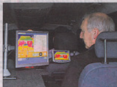
DRIVE-BY INSPECTIONS: The top picture shows a red, poorly insulated home, in contrast to the blue

the partnership to help encourage their residents to be more environmentally friendly.